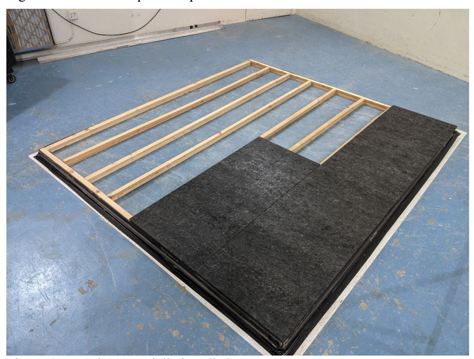
Figure 4 – Specimen partially installed over spacers