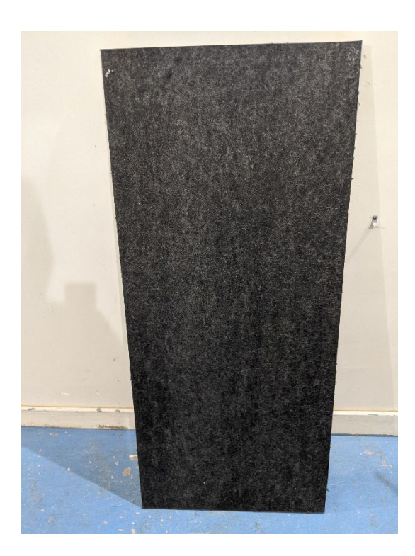
Figure 3 – Individual specimen panel