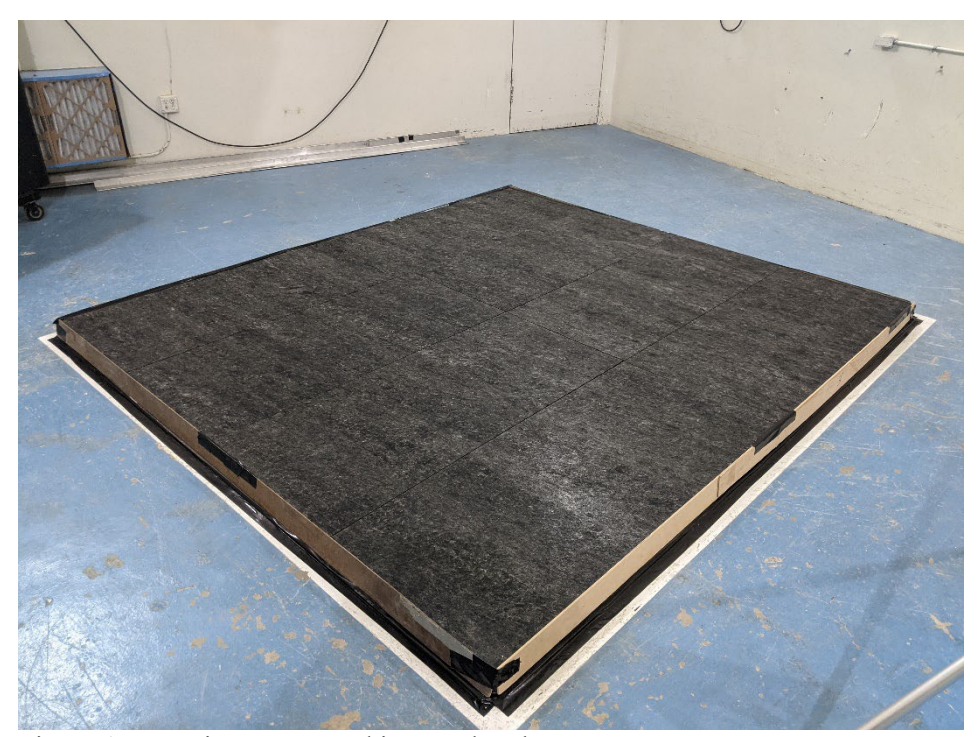
Figure 1 – Specimen mounted in test chamber