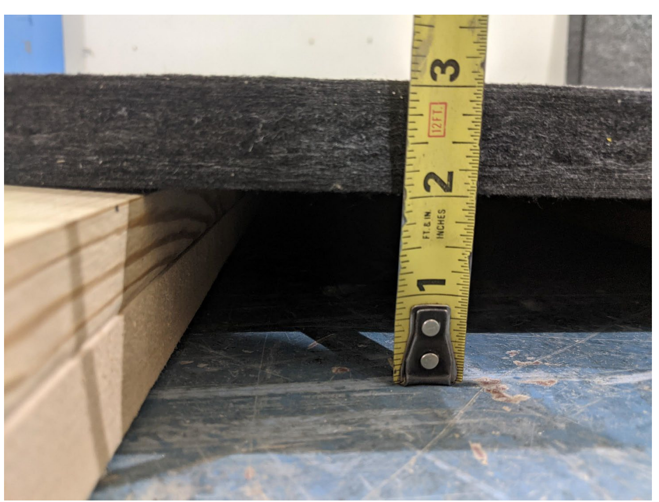
Figure 5 – Detail of specimen materials and airgap depth