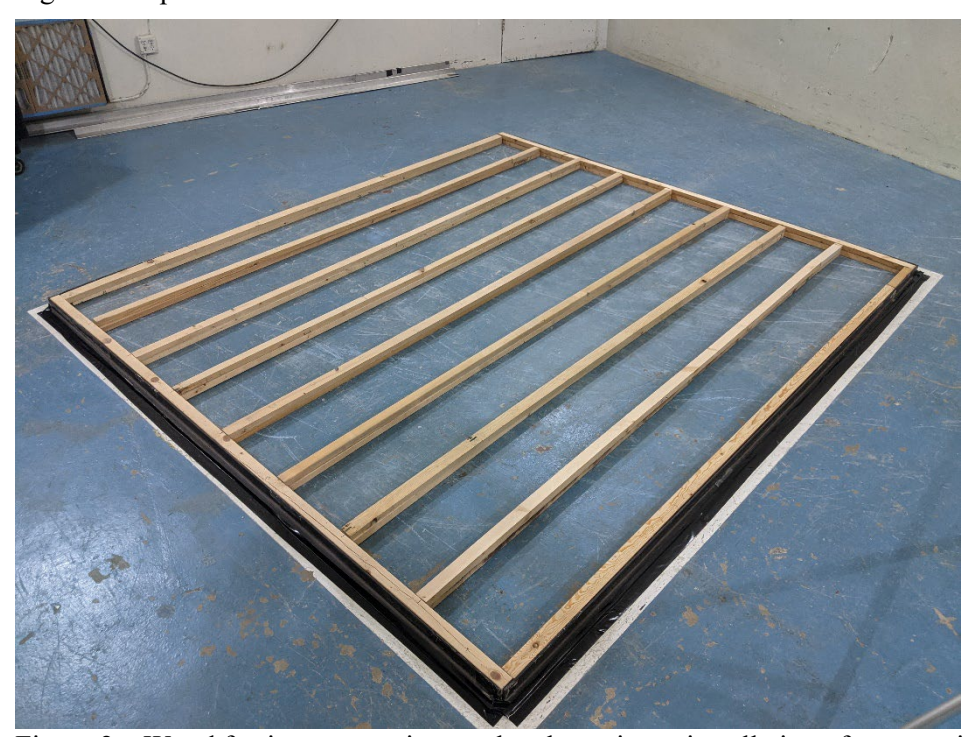
Figure 2 – Wood furring spacers in test chamber prior to installation of test specimen